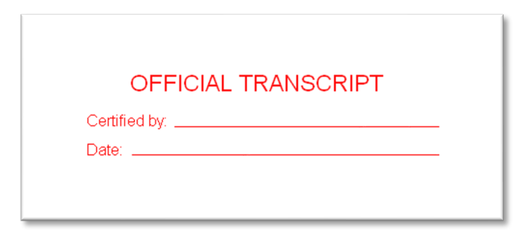
Fig. 1. Official transcript stamp, available from Academic Program Quality upon request.

To certify a transcript as official, the UCF faculty or staff member who received the transcript must mark the transcript with an "official transcript" stamp (see figure 1 below) and sign and date in the fields provided to reflect the date on which the transcript was opened.